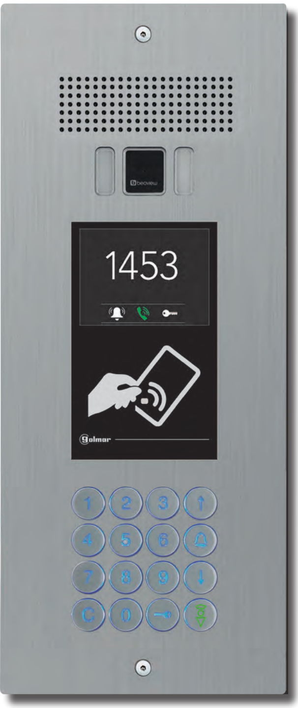
155(W) x 370(H) mm 6.10"(W) x 14.57"(H)