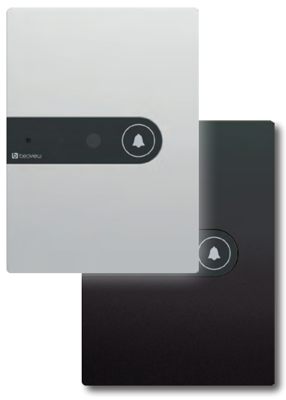
102(W) x 140(H) mm 4.02"(W) x 5.51"(H)

Door panels with IP technology are available under several skins. It is possible to create any push button configuration, thanks to the Nexa panels flexibility.